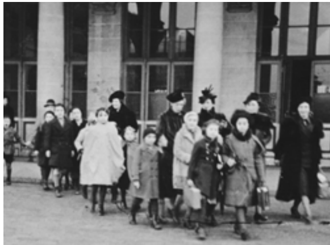
A group of Jewish children arriving from Germany.