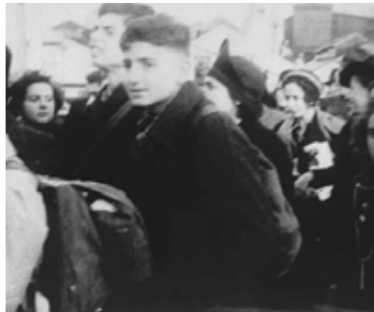
Jewish children from Germany on a Kindertransport.

People around the world were outraged by the events of Kristallnacht , but only a few were willing to offer Jewish refugees a safe haven. Among them were a number of Jews and Christians in Britain and Nazi-occupied Europe. These men and women decided to focus their efforts on children under the age of seventeen, because they feared the British would see adults as competitors for jobs, housing, and social services. To counter the argument that the children would be a burden on taxpayers, they promised government officials that private citizens and/or organizations would pay for each child’s care, education, and his or her eventual return home. In return, Britain permitted unaccompanied refugee children to enter the country. Once World War II began, the British banned all further immigration from Nazi-occupied countries.