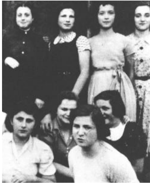
Group portrait of Jewish refugee girls from Germany who came to England on a Kinderstransport.

Sometimes I feel I am a ghost adrift without identity what as a child I valued most forever has escaped from me I have been cast out and am lost