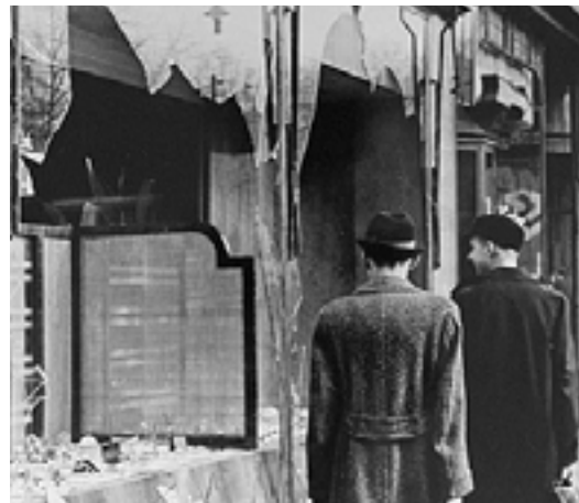
During Kristallnacht the Nazis destroyed stores and shops owned by Jews.

In the fall of 1938, many Europeans and Americans discovered how desperate the situation was for Jews in Greater Germany. In October, Hitler announced plans to expel all Jews who were technically citizens of another country. Those who held Russian passports were the first to go. Fearing that the 70,000 Polish Jews in Greater Germany would be next, the Polish government required each to have a special stamp on their passport. Yet when Polish Jews tried to secure the stamp, they were turned away. The crisis came to a head when Poland announced that it would not issue stamps after October 31. On October 26, the Nazis responded by expelling all Polish Jews. When Poland refused to accept them, thousands ended