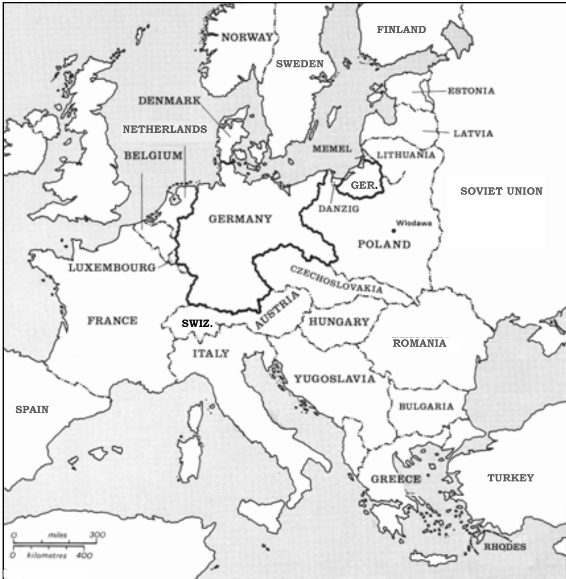
This map shows national borders before Germany's annexation of Austria in March, 1938.