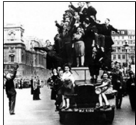
A victory celebration in London.