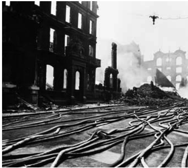
London after the Blitz, May 11, 1941.