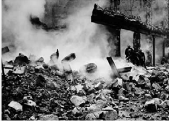
Newgate Street in London, December 29, 1940.

The German bombers that suddenly appeared in the skies over London on the afternoon of September 7, 1940, marked a shift in the Nazis' military strategy. In July and August, they had targeted airfields and radar stations in preparation for an invasion of the island. Hitler now decided to bomb civilian targets in the hopes of demoralizing the British. At around 4:00 pm that day, 348 German bombers, escorted by 617 fighters, blasted London for two straight hours. After a two-hour break, another group of bombers began an attack that lasted until 4:30 the following morning.