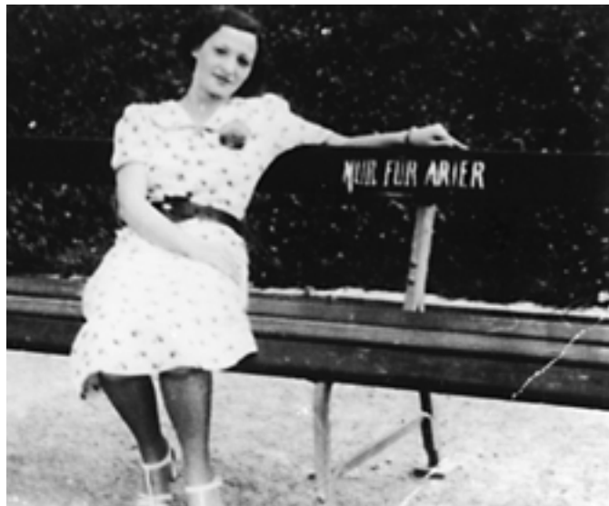
A woman sits on a park bench in Germany marked "Only for Aryans."